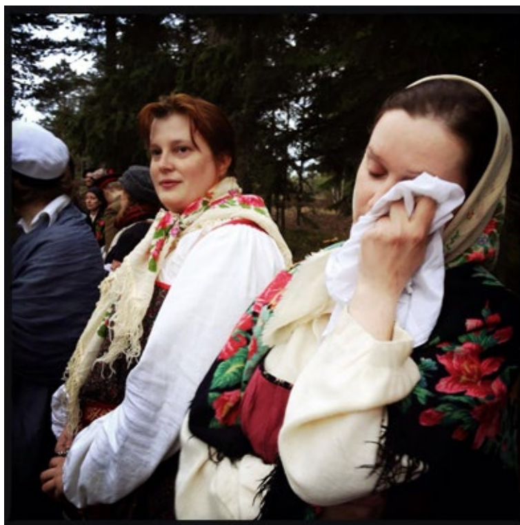
The folk singer (on the right) crying together with other Karelian women.

With both the Great War and the Russian civil war raging, the political and military situation changed almost weekly in the summer of 1918. This made an excellent setting for a larp, with numerous groups, switching loyalties, and the flavour of a colonial adventure (which it was!). For a historical setting, it also had the benefit of being a less-known corner of the Finnish Civil War era, which most Finns know well. Moreover, Finns may still identify with one or the other side of the war, based on family history and/or political leanings. This made for passionate larping with surprising twists.